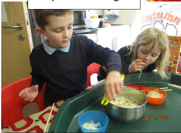
Trying Chinese noodles for the first time!