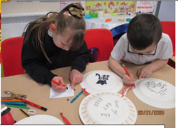
Creating our year of the rat Chinese drum!