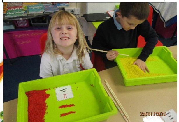
Drawing Chinese numbers in rice.