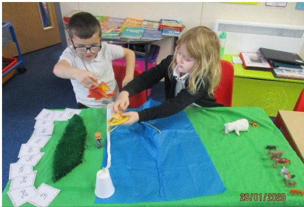
Which animal will cross the river first?